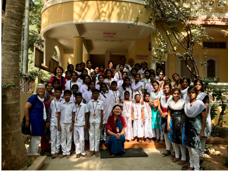
The whole crew visiting a friend in Puttaparthi