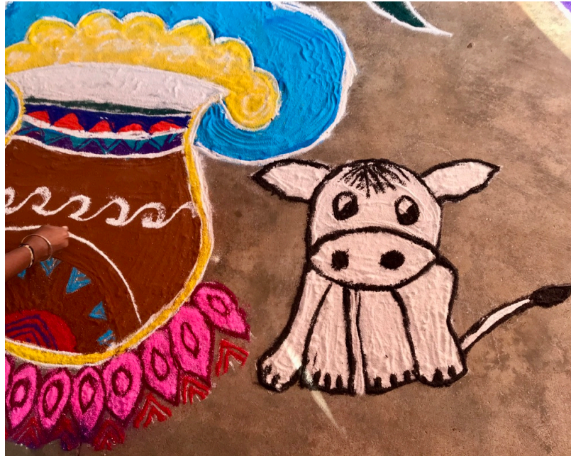
The girls made exquisite Rangolis for the competition. I adore this little friend! 🥰