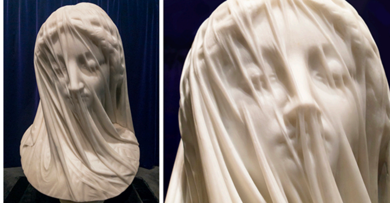
Giovanni Strazza, The Veiled Virgin , ca. 1850. Behind the veils of the manifold, transient layers of personality lies the face of the true self, deeply absorbed in Divine Ecstasy (called Sat-Chit-Ananda in India).

a quantum leap in the consciousness of that soul. The veils of appearance are recognized and dissolve one by one until only the Real Self remains. The worlds of appearance and reality have kept adepts, thinkers and artists alike captivated as they tried to express their concepts in art, literature, and spiritual science.