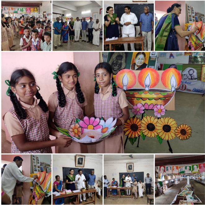
The photos were taken at Ramasamy Pillai Hr. Sec. School, Ilanji

Liked by students, artists, devotees, and speakers alike, the Cultural November Programs of the Aum Pranava Ashram are slowly turning into a locally popular function. One of the highlights of the programs was the Community Service Events in three different schools. Together with the teachers of the respective schools, we devised competitions in the fields of sport, drawing, and essay writing, which was fun for the children. We are grateful to all the school authorities and staff members who made these events possible, but above all, the students for their enthusiastic participation!