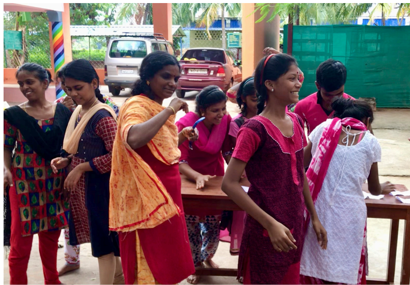
Staff members and children together - just relaxed and happy!