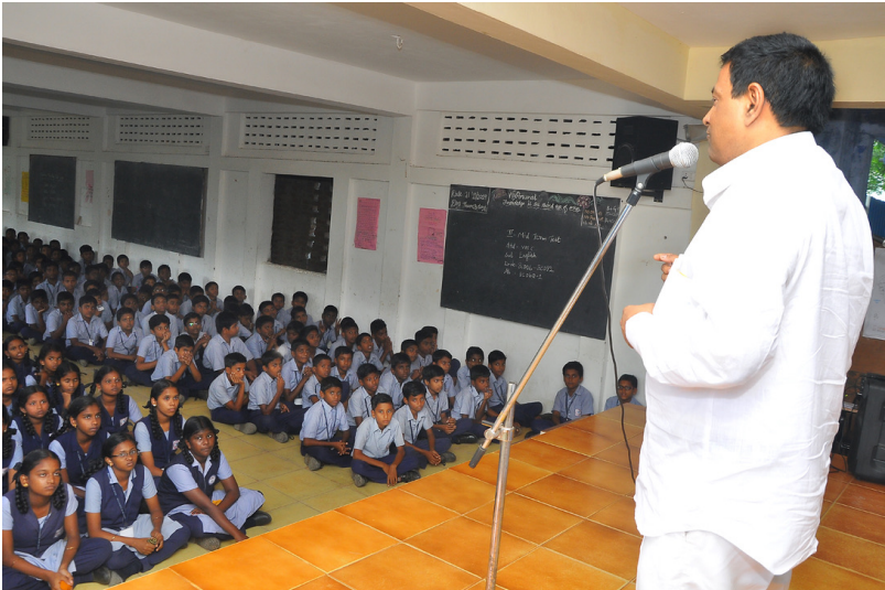
Spectrum Hr. Sec. School